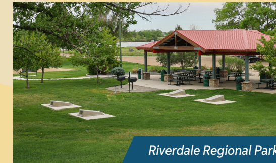
Riverdale Regional Park