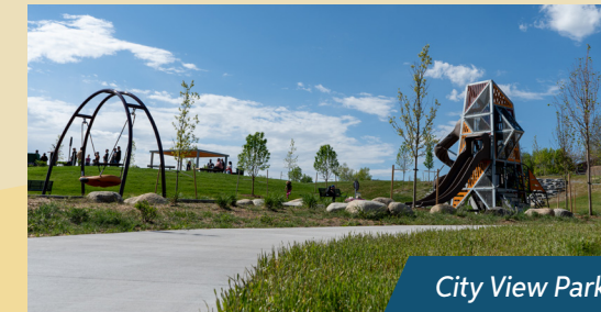
City View Park

Riverdale Regional Park is the largest park in Adams County's system and is home to community events, public art, the Adams County Veterans Memorial, fairgrounds, Adams Hollow Disc Golf Course, the Riverdale Golf Courses, Path to Wellness, trails, fishing lakes, volleyball, cornhole, greenspace, and more. Reserve a pavilion or learn more about Riverdale Regional Park by calling 303.637.8000 .