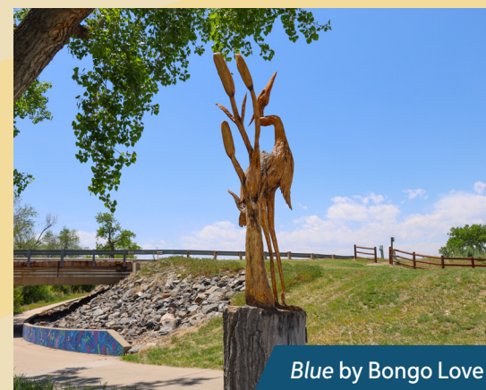
Blue by Bongo Love