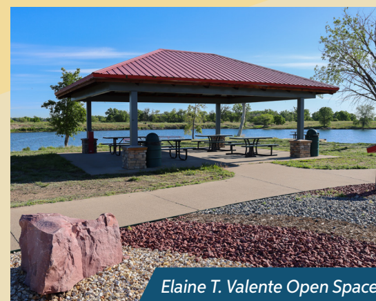
Elaine T. Valente Open Space

Public art is woven throughout Adams County's parks, trails, and open spaces. Tree carvings, sculptures, and murals are placed within our parks and along our trails to enhance the natural beauty found in Adams County. Visit adamscountyco.gov/cultural-arts to learn more about Adams County's commitment to public art.