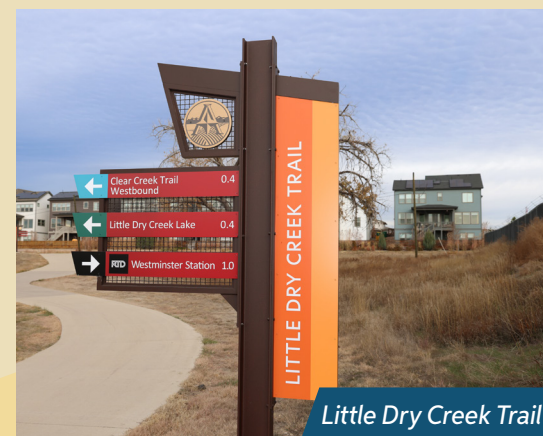
Little Dry Creek Trail

The South Platte River Trail is the major regional trail in the Denver metro area, with approximately 14 miles of the trail located in Adams County. Trail users can access most of the other major area trails from the South Platte Trail, as well as Riverdale Regional Park, Pelican Ponds Open Space, and Elaine T. Valente Open Space.