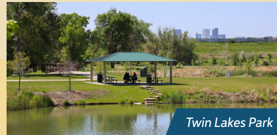
Twin Lakes Park

Rotella Park is a 20-acre gem located in the Welby neighborhood. Access to the Niver Creek and South Platte trails, fishing, basketball and volleyball courts, walking paths, and birdwatching make Rotella Park the perfect destination for all park users. To reserve a pavilion at Rotella Park, call 303.637.8000 .